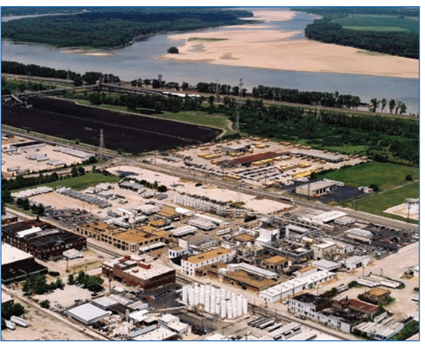
ELANTAS PDG, Inc. headquarters in St. Louis, Missouri

ELANTAS Electrical Insulation companies are strategically located throughout the world to meet the primary insulation, secondary insulation and electronic and engineering materials needs of our customers.